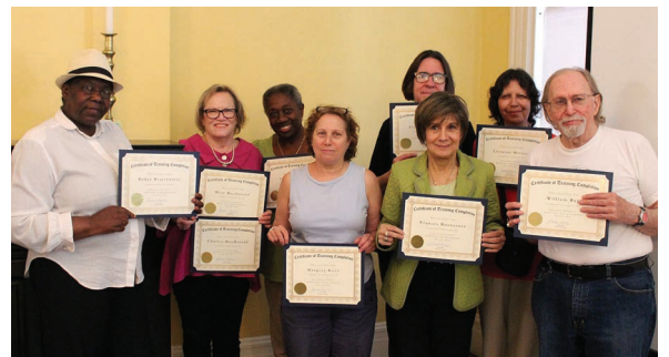
▲ A group of newly trained AgeWells with their diplomas. They make home visits to seniors to conduct health screenings using the new app.

The goal is to improve health outcomes and quality of life by reducing preventable hospital visits, ultimately lowering medical costs, and increasing the use of preventive health care among seniors.