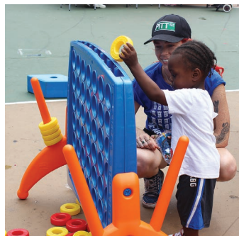
People of all ages enjoyed the array of activities at the Community Advisory Board's Community Day in July.