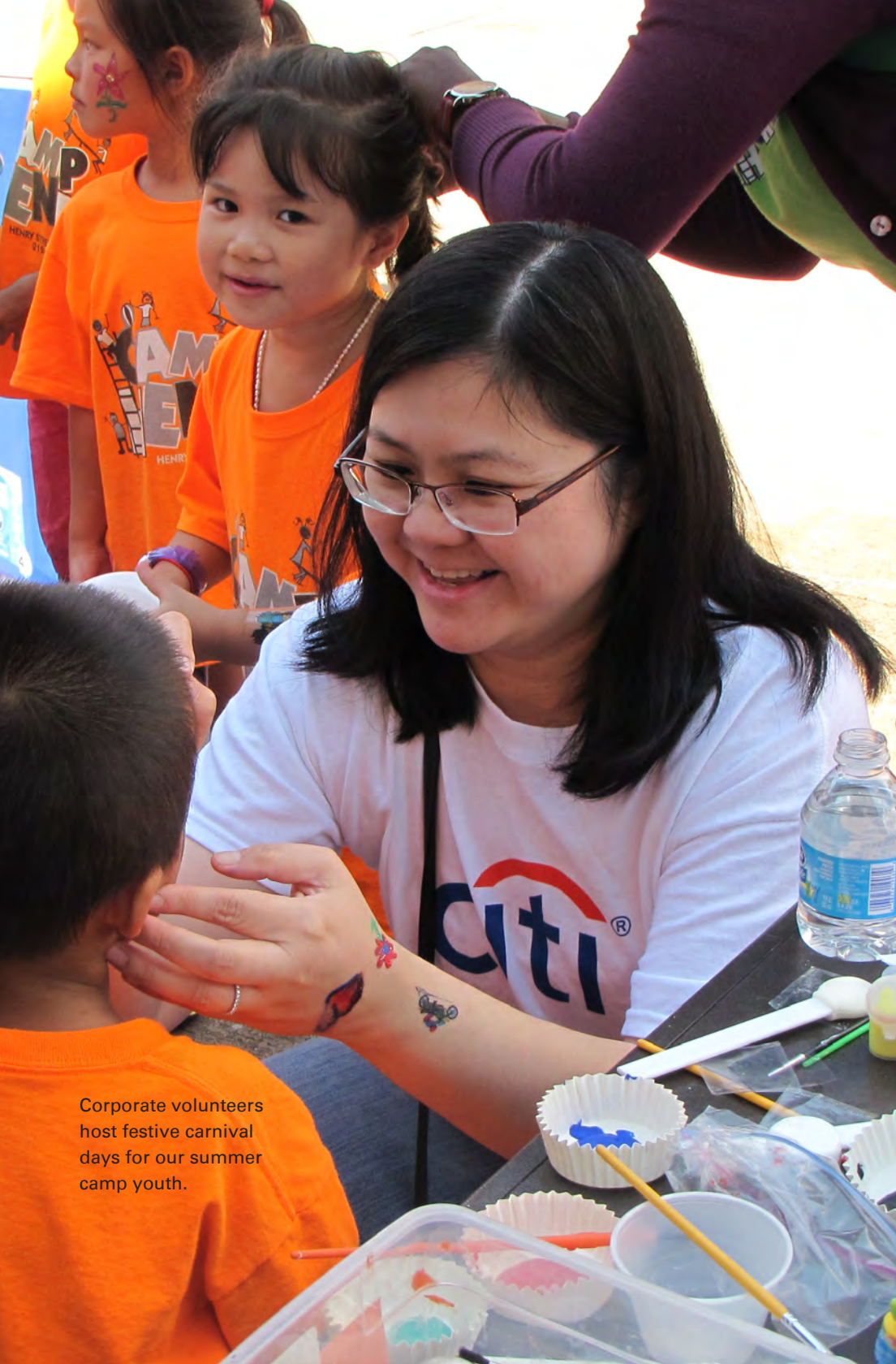
Corporate volunteers host festive carnival days for our summer camp youth.