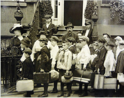
Lower East Side boys ready to board the bus to Henry Street's upstate camp, c.1900.

Here is a sneak preview of some images from The House on Henry Street exhibition. What we can't show on these pages are the videos, artifacts, and the entire experience. For that, you'll have to visit!