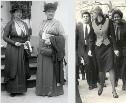
Henry Street founder Lillian Wald, left, with Jane Addams, founder of the first settlement house in America, Hull House in Chicago.