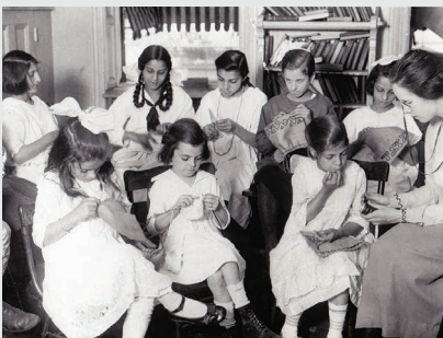
Girls learning to sew in an early recreation class.