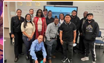
The second Building Systems Automation class graduated in June 2022; most students have found jobs in the industry.