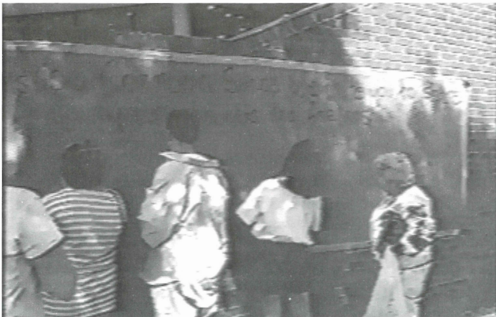
Photographs on this page and the front page are stills taken from two videos, "You Are Not Alone," which was created to document and commemorate life after September 11th on the Lower East Side, and a Channel L Working Group video.